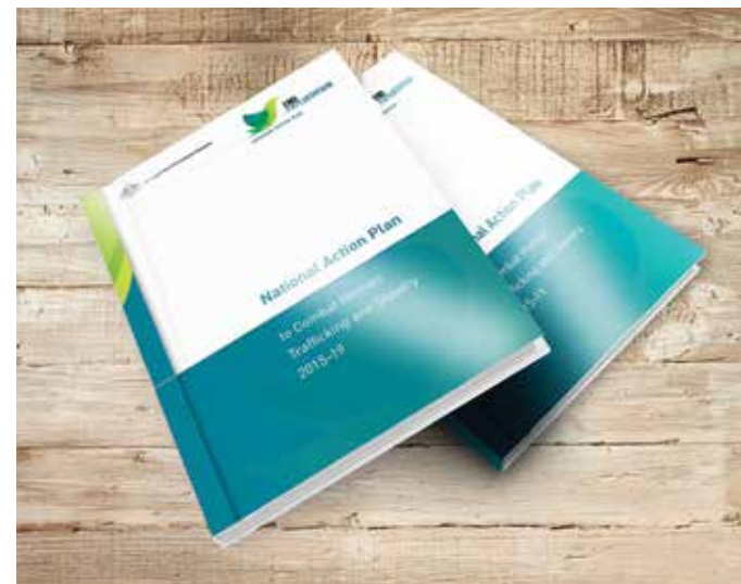
The Australian Government's National Action Plan to Combat Human Trafficking and Slavery 2015-19

The role of Government and their ability to work with other Governments, international agencies and civil society organisations is considered vital in the fight against human trafficking and slavery.