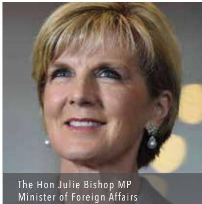
The Hon Julie Bishop MP Minister of Foreign Affairs

The Hon Malcolm Turnbull MP, Prime Minister of Australia