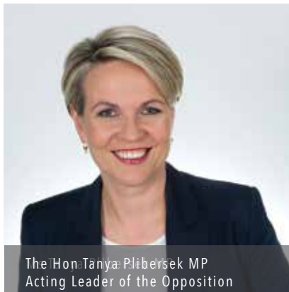
The Hon Tanya Plibersek MP Acting Leader of the Opposition