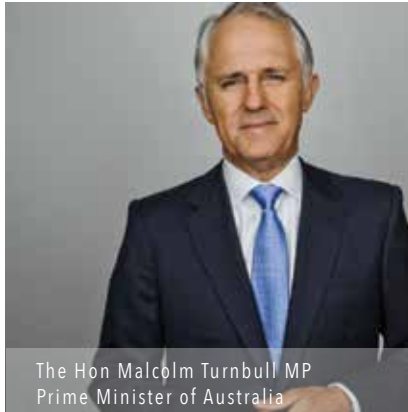
The Hon Malcolm Turnbull MP Prime Minister of Australia

The Hon Malcolm Turnbull MP, Prime Minister of Australia, was not able to attend 3rd December launch, however his message of solidarity was a powerful reminder of why the Australian Freedom Network is so important in the fight against slavery in Australia.