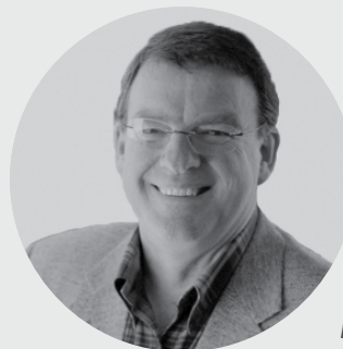
Right Rev David Cook Moderator Presbyterian Church of Australia

We are called to rise up, to speak out and to act, to end modern slavery."