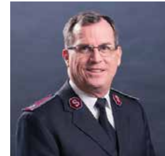
Commissioner Floyd Tidd, Australia Southern Territory