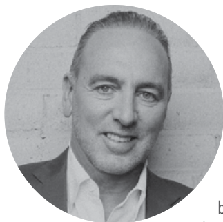
Pastor Brian Houston Hillsong Church

"From the very beginning human beings were created in the image of God.