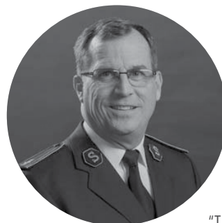
Commissioner Floyd Tidd The Salvation Army Southern Territory

We proudly support this network for the elimination of human trafficking and slavery which is an abomination of human rights and dignity."