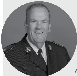
Commissioner James Condon The Salvation Army Eastern Territory

"The Salvation Army Australia is deeply committed to ending modern slavery however it may be manifested. The Salvation Army stands together, united in one purpose, and with one voice to affirm that modern slavery must end.